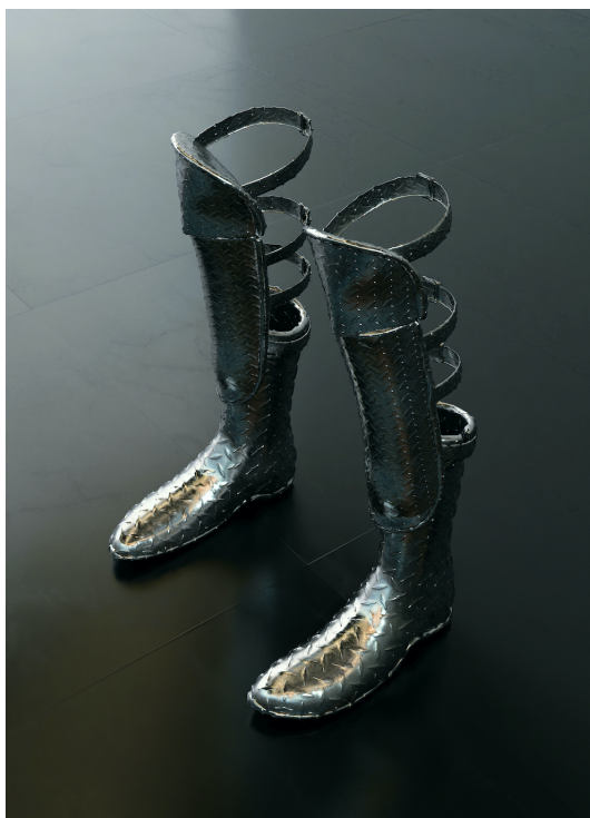
[Alt Text / ID: a pair of empty armoured sabaton shoes and greave shin guards, steel propeller plate.]

For press / access enquiries please contact: press@dartsldn.com